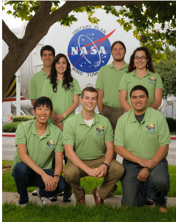
2013 SLSTP participants at Ames.

investigations in microgravity, partial gravity, and hypergravity.