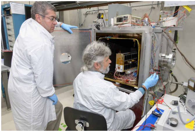
NASA's first 6U nano-satellite, EcAMSAT, undergoes thermal vacuum power management (TVPM) testing at NASA Ames. The test simulates the thermal vacuum and power environment of space and is an element of the spacecraft's flight validation testing program.

set is a control and receives no antibiotic agent, only buffer solution. After 24 hours a fluid exchange occurs and alamarBlue®, a dye used to determine viability of the bacteria by measuring its metabolism, is then introduced to all wells and viability is tracked for at least 24 hours. An optical system tracks viability by color change of the 'viability dye', which changes from blue to pink when enzymes generated by cellular metabolic processes act upon it. EcAMSat acquires data from optical measurements in realtime. It is capable of autonomous operation and stores 96 hours of data. Overall, the experiment will determine the lowest concentration of antibiotic that inhibits bacterial growth. The knowledge gained in this experiment may be useful for prescribing the correct dose of antibiotics for future space travelers.