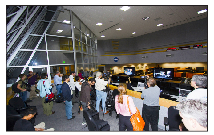
The Young-Crippen Firing Room, formerly Firing Room 1, was extensively remodeled to serve as a flexible nerve center for several kinds of rockets and spacecraft. The workstations and computer networks are modern designs and can be tailored to the needs of specialized engineers no matter where they sit.