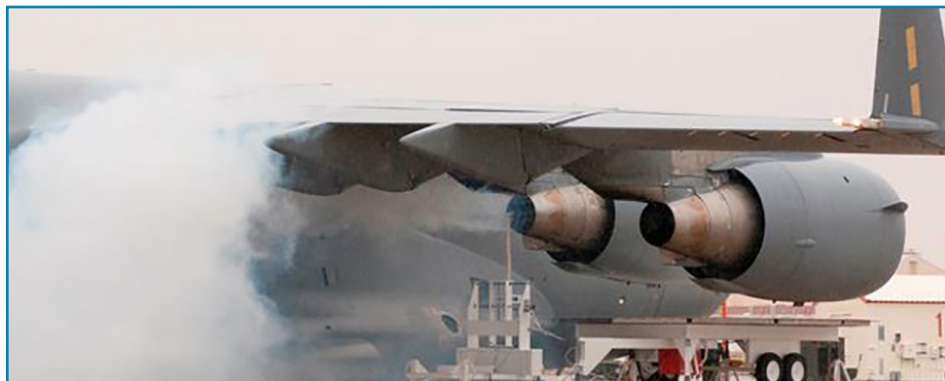
Volcanic ash is sprayed into a F-117 engine of a C-17 aircraft.