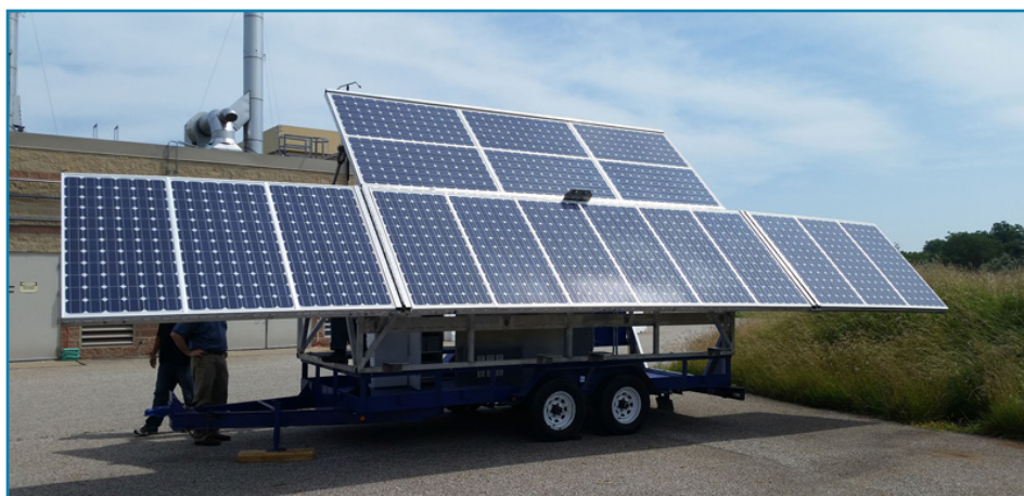
Above: The mobile solar power plant mounted on a trailer. When solar array panels are deployed, they span 512 feet.

Students in EHOVE's electrical technology, industrial technology, and collision and refinishing classes, trained by Glenn technicians, worked on the project at both the career center and at Lewis Field. These students installed wiring and electrical boxes, welded sections of the solar frame and painted the trailer. Additionally, three students worked with Glenn's Manufacturing Division to earn welding certification using NASA specifications.