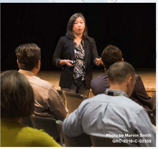
Dr. Su describes the effort of setting up camp on a dig.