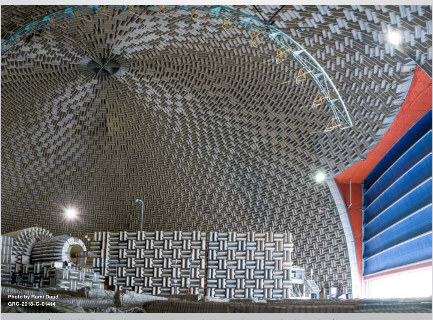
Glenn's AAPL offers an environment to conduct tests aimed at reducing noise produced by an aircraft's engine exhaust.