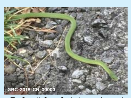
The Smooth Green Snake is an endangered species that exists at Plum Brook Station.

NASA Glenn's 6,454-acre Plum Brook Station (PBS) is home to a number of threatened and endangered plants and animals. Many of these species are found in unique habitats—ranging from prairie meadows to mesic forests to oak savannas—that are in need of ecological restoration and/or maintenance.