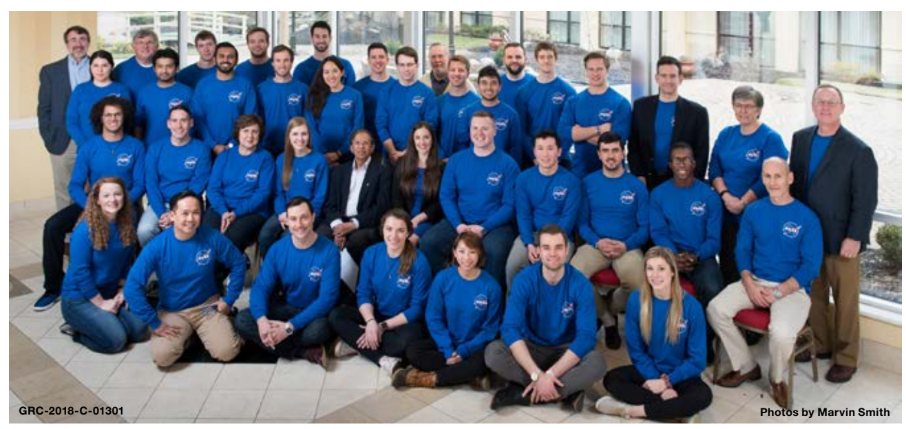
Big Idea Challenge student finalists, advisers and judges pause for a group photo prior to a tour of Glenn facilities.