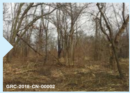
AFTER: Area after heavy brush was cleared.