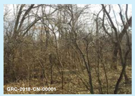
BEFORE: Area with heavy brush before clearing.