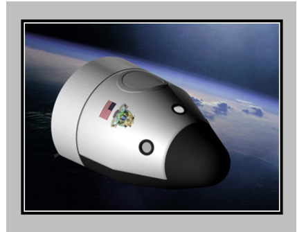
Computer-Generated Picture of the Blue Origin Space Vehicle

Blue Origin is developing vehicles and technologies to dramatically lower the cost and increase the reliability of human access to space. The NASA investment during the CCDev 2 effort will accelerate development of a crew transportation system capable of transporting crew and cargo safely and affordably to low Earth orbit. Their crew transportation system is comprised of a reusable biconic space vehicle launched first on an Atlas V launch vehicle and then on Blue Origin's own Reusable Booster System. The Reusable Booster System features a new, low cost liquid oxygen/liquid hydrogen engine that could potentially be suitable for a variety of other applications.