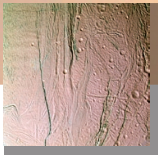
A close-up image of Saturn's moon Enceladus shows a system of rifts and lanes of grooved terrain that separate two geological provinces.