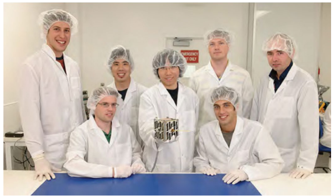
The PhoneSat Design and Integration Team at NASA Ames Research Center

matures technologies to enhance and expand the capabilities of small spacecraft with a particular focus on communications, propulsion, pointing, power, and autonomous operations. The PhoneSat project started in Summer 2009 as a student-led collaborative project between NASA Ames and the International Space University, Strasbourg.