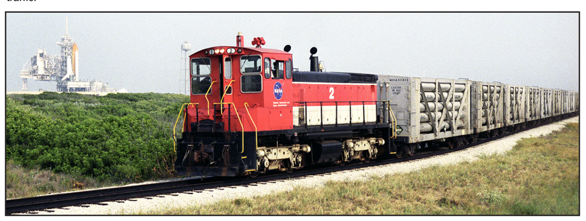
A NASA locomotive passes by a space shuttle on a launch pad at Launch Complex 39 en route to Cape Canaveral Air Force Station on the NASA Railroad. The train is delivering helium, a commodity used in launching the Titan rocket.

They were delivered to Kennedy from the Thiokol plant in Wasatch, Utah, over a route that uses the Union Pacific, Kansas City Southern, Norfolk Southern, CSX and Florida East Coast Railway.