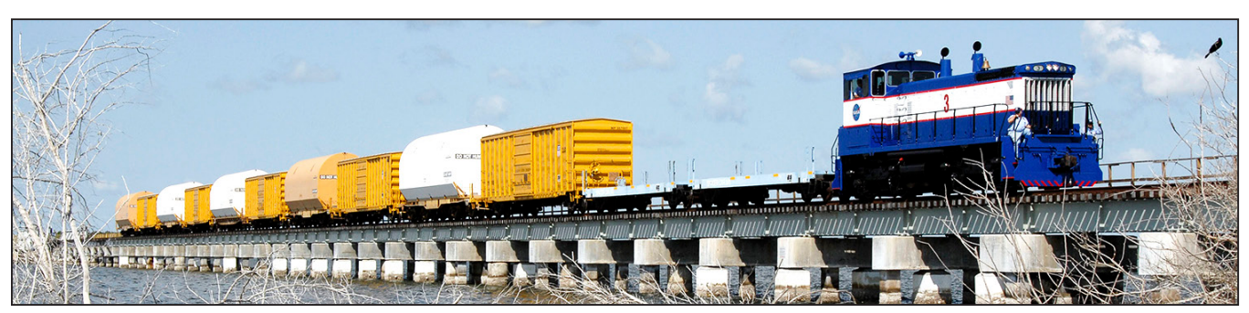
A NASA train crosses the Indian River on the NASA Railroad to deliver solid rocket boosters for the space shuttle at Kennedy Space Center. For safety, box cars serve as spacer cars between the individual booster segments.

If ever needed, the original plan was to fly the equipment in waves of Air Force C-5 and C-141 air cargo planes. However, at the time of the STS-3 landing, they were not available in sufficient time to have the equipment on the ground at White Sands for Columbia's arrival. Using equipment furnished by the Sante Fe Railroad, two trains were used to move the equipment over the lines of Sante Fe and Southern Pacific for the 1,000-mile distance between Edwards and White Sands. By using rail, the cost saving to NASA was more than $2 million for the equipment's round trip.