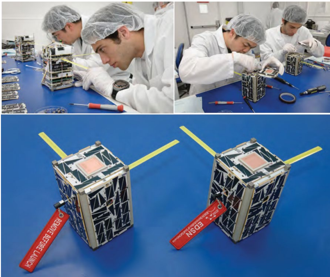
EDSN Spacecraft Assembly Sequence (top) and Completed EDSN Spacecraft (bottom)