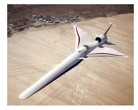
Illustration of the X-59 QueSST as it flies above NASA's Armstrong Flight Research Center in California. Credits: Lockheed Martin