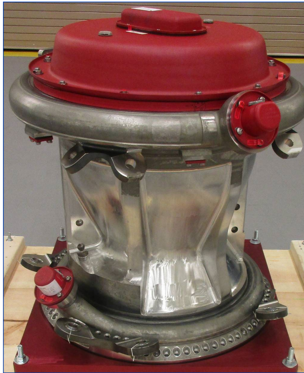
NASA is testing a new main combustion chamber made by modern manufacturing techniques during RS-25 engine hot fires at Stennis.