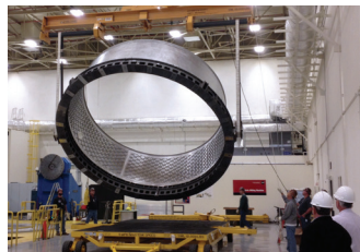
Orion Stage Adapter at the Marshall Center