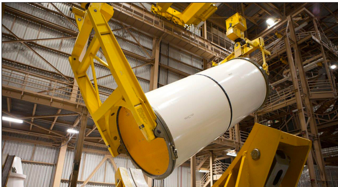
Inside the Rotation, Processing and Surge Facility high bay at NASA's Kennedy Space Center in Florida, a crane and lifting mechanism are used to lift the first of two pathfinders, or test versions, of solid rocket booster segments for NASA's Space Launch System rocket away from the railcar on Feb. 25, 2016.