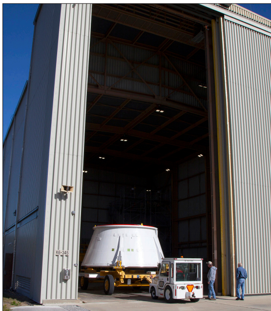
An aft skirt similar to one that will be used on a solid rocket booster for NASA's Space Launch System rocket, arrived at the Rotation, Processing and Surge Facility at NASA's Kennedy Space Center in Florida on Jan. 20, 2016. The aft skirt was inspected and prepared for SRB pathfinder operations.

The facility is over 90 feet high, more than 190 feet long, and about 90 feet wide. The large open area, called the high bay, contains several work stands and work platforms to provide access to hardware during processing. Two 200-ton cranes, one located at the east end of the building, and the other at the west end, are positioned to lift the booster segments from a horizontal position to a vertical position. A crane control room