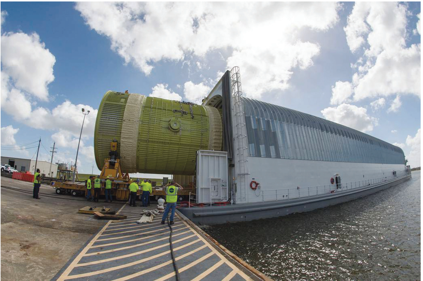
A structural test version of the intertank for NASA's new heavy-lift rocket, the Space Launch System, is loaded onto the barge Pegasus, at NASA's Michoud Assembly Facility in New Orleans. Pegasus, originally used during the Space Shuttle Program, has been redesigned and extended to accommodate the SLS rocket's massive, 212-foot-long core stage — the backbone of the rocket.

Michoud's history dates back to the 1700s when it was part of a French Royal land grant and later became the site of a sugar cane plantation and refinery operated by Antoine Michoud. The U.S. government purchased the land in 1940 and built a production facility to manufacture cargo aircraft, tank engines and more. NASA acquired the facility in 1961.