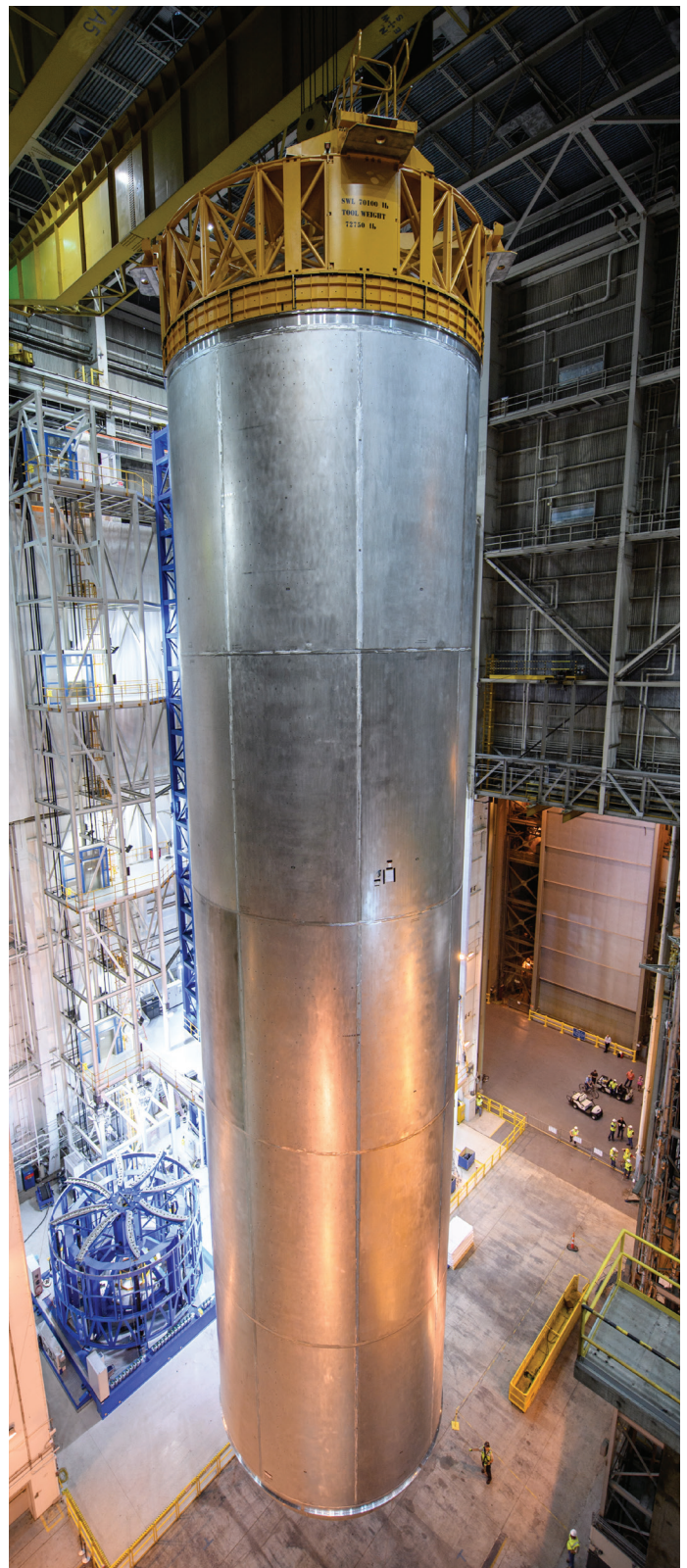
A qualification test article for the liquid hydrogen tank on NASA's new heavy-lift rocket, the Space Launch System, is lifted off Michoud's Vertical Assembly Center after final welding is complete.

Situated on 829 acres of land, the Michoud Assembly Facility features more than 2 million square feet of manufacturing space, and more than 300 acres of green space for expansion. The site includes numerous open, high-bay areas, an extensive overhead crane network and the 45,000-square-foot Vertical Assembly Center, the world's largest robotic tool for building rockets, for the integration and stacking of large-scale structures. Its list of state of the art manufacturing capabilities includes friction stir welding, composite materials fabrication and curing, non-destructive evaluation, fiber placement machines, gantry machining centers, advanced laboratory services, build to print part/component fabrication, modeling and simulation services and much more.