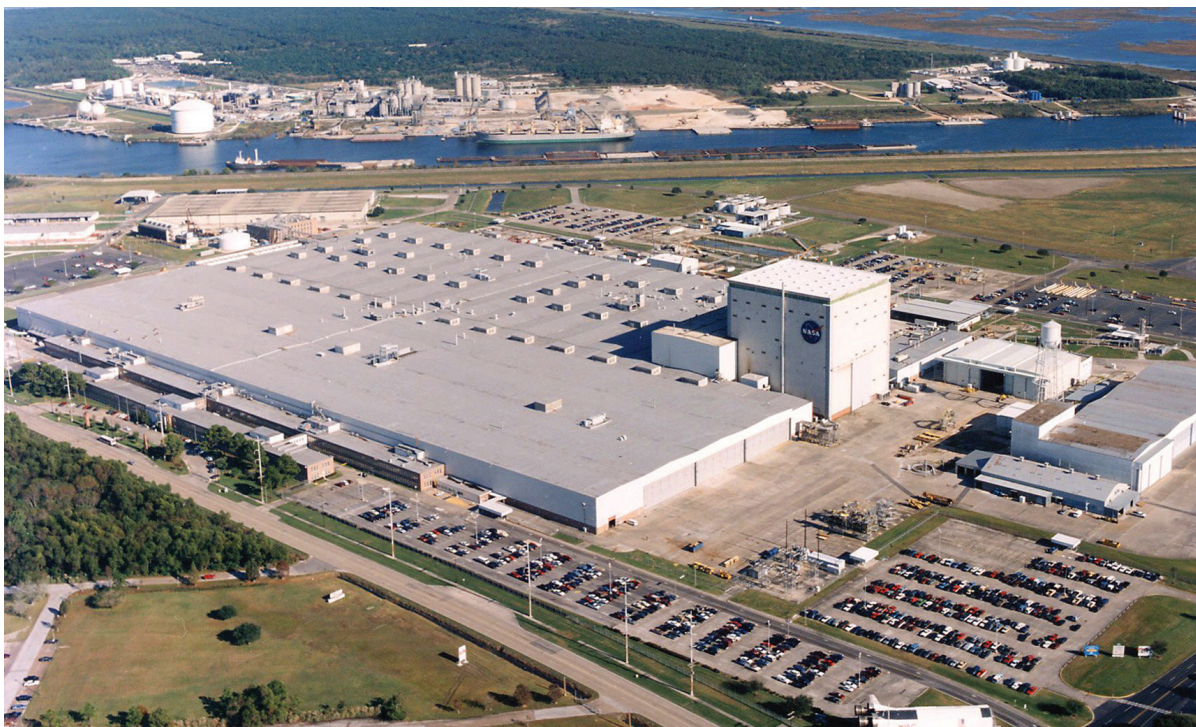
An aerial view of the main building at Michoud Assembly Facility, which features more than 43 acres of advanced manufacturing under one roof and convenient interstate, railway and port access.

Using state-of-the-art manufacturing and welding equipment — including a friction-stir-welding tool that is the largest of its kind in the world — technicians at Michoud manufactured the core stage's major structures, which are being outfitted with avionics, thermal protection systems and other internal hardware.