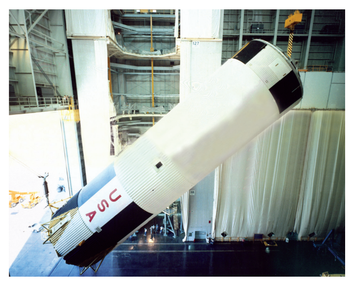
Experience and expertise gained while building the Saturn stages (left) and the space shuttle external tanks (right) benefit SLS core stage development and manufacturing.

For more information about Michoud and its role in the nation's space program, visit: