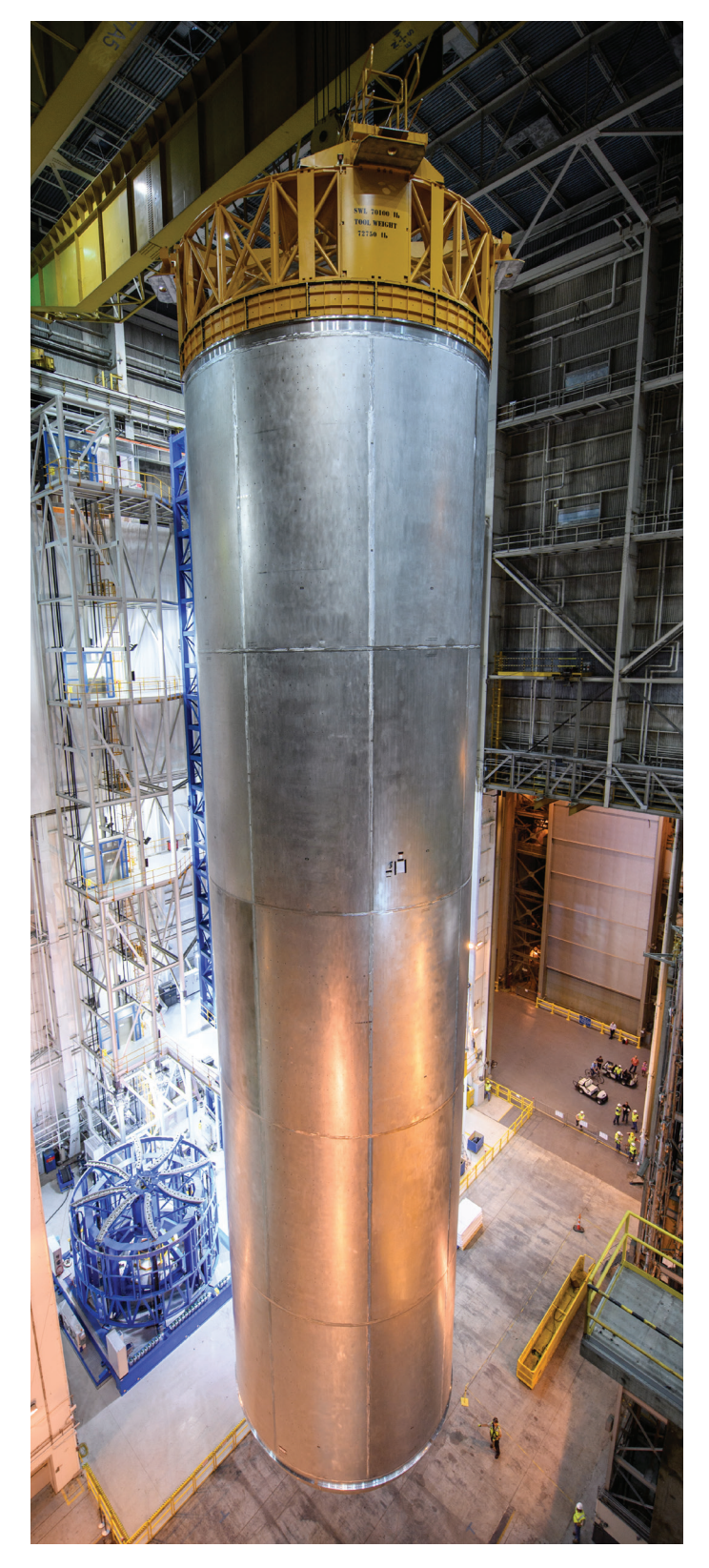
A qualification test article for the liquid hydrogen tank on NASA's new heavy-lift rocket, the Space Launch System, is lifted off Michoud's Vertical Assembly Center after final welding is complete.

Situated on 829 acres of land, the Michoud Assembly Facility features more than 2 million square feet of manufacturing space, and more than 300 acres of green space for expansion. The site includes numerous open, high-bay areas, an extensive overhead crane network and the 45,000-square-foot Vertical Assembly Center, the world's largest robotic tool for building rockets, for the integration and stacking of large-scale structures. Its list of state of the art manufacturing capabilities includes friction stir welding, composite materials fabrication and curing, non-destructive evaluation, fiber placement machines, gantry machining centers, advanced laboratory services, build to print part/component fabrication, modeling and simulation services and much more.