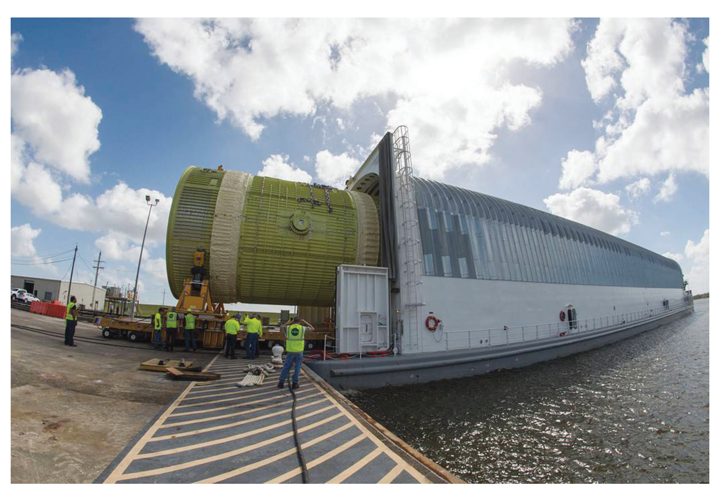
A structural test version of the intertank for NASA's new heavy-lift rocket, the Space Launch System, is loaded onto the barge Pegasus, at NASA's Michoud Assembly Facility in New Orleans. Pegasus, originally used during the Space Shuttle Program, has been redesigned and extended to accommodate the SLS rocket's massive, 212-foot-long core stage — the backbone of the rocket.

Michoud's history dates back to the 1700s when it was part of a French Royal land grant and later became the site of a sugar cane plantation and refinery operated by Antoine Michoud. The U.S. government purchased the land in 1940 and built a production facility to manufacture cargo aircraft, tank engines and more. NASA acquired the facility in 1961.