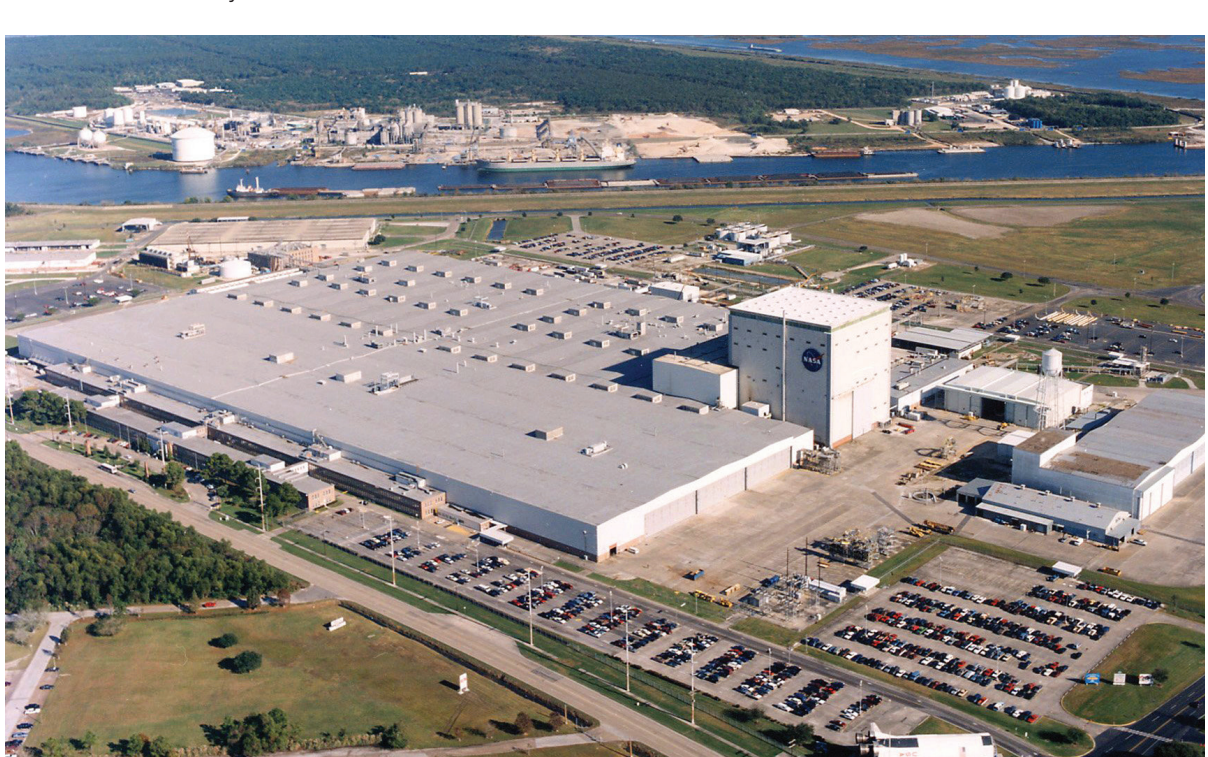
An aerial view of the main building at Michoud Assembly Facility, which features more than 43 acres of advanced manufacturing under one roof and convenient interstate, railway and port access.

Using state-of-the-art manufacturing and welding equipment — including a friction-stir-welding tool that is the largest of its kind in the world — technicians at Michoud manufactured the core stage's major structures, which are being outfitted with avionics, thermal protection systems and other internal hardware.