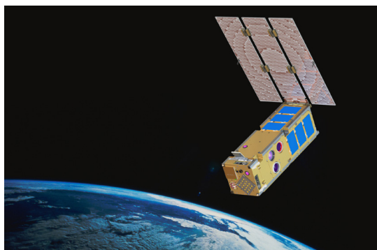
ISARA Spacecraft Configuration with 3U CubeSat and Solar Array with Integrated Reflectarray Antenna

The ISARA technology will be validated in space during a five-month mission to measure key reflectarray antenna characteristics, which include how much power can actually be obtained over its field of view. ISARA contains a transmitter and an avionics subsystem that features a Global Positioning System (GPS) receiver and a high precision attitude control system designed to orient the CubeSat to enable accurate antenna beam pointing. Once in orbit, ISARA will deploy its solar array