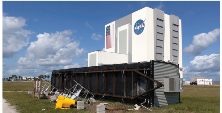
This Sept. 12, 2017 photo shows a trailer flipped on its side at the Turn Basin as part of damage Kennedy sustained during Hurricane Irma. In the background is the iconic Vehicle Assembly Building.

vices and infrastructure and return the center to normal safe operating conditions following a storm. This team is organized in accordance with Federal Emergency Management Agency (FEMA) standards.