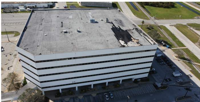
Kennedy Space Center's Operations Support Building I (OSB I) was one of several structures that were damaged by Hurricane Matthew, which hit Florida's Space Coast in October 2016.

As soon as the storm passes, the ROT does a windshield survey, making observations from a vehicle. The ROT addresses the immediate issues before handing off to the Damage Assessment and Recovery Team.