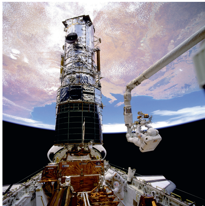
Astronauts F. Story Musgrave (anchored on the end of the Remote Manipulator System arm) and Jeffrey A. Hoffman (bottom of frame) work on Hubble during the first servicing mission in December 1993.

NASA has conducted five astronaut-servicing missions to repair and upgrade Hubble. These refurbishments, along with the redundancies originally designed into the observatory's critical subsystems, should keep Hubble running for years to come. Based on formal reliability studies, engineers believe that there is a high probability that Hubble's instruments and primary spacecraft subsystems (gyros, reaction wheels, solar arrays, batteries, etc.) will continue to operate until at least the year 2020. NASA's goal is to operate Hubble concurrently with the James Webb Space Telescope, the agency's new and most capable infrared observatory, planned for launch in 2021.