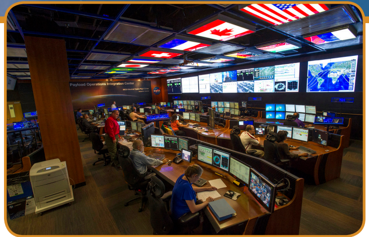
Payload Operations Integration Center

The Payloads Operations Center (POC), also known as the Payload Operations Integration Center (POIC), provides the capability for payload users to operate their payloads at their home sites. In this environment, TReK provides local ground support system services and an interface to utilize remote services provided by the POC. TReK provides ground system services for local and remote payload user sites including International Partner sites, Telescience Support Centers, and U.S. Investigator sites in over 40 locations worldwide.