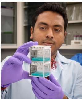
The first flight experiment to use the Compact Science Experiment Module aboard the space station was designed and built by students at Ames.

trays can be preserved aboard the station for post-flight analysis. The system was flown on the shuttle middeck on STS-121 in 2006 and to the station in 2015 for the Fruit Fly Lab-01 mission. This system also can interface with various existing environmental chambers, centrifuge systems, and video and lighting systems that have been developed by commercial providers. Such facilities can provide additional capabilities of variable gravity levels, environmental controls and imaging during spaceflight.