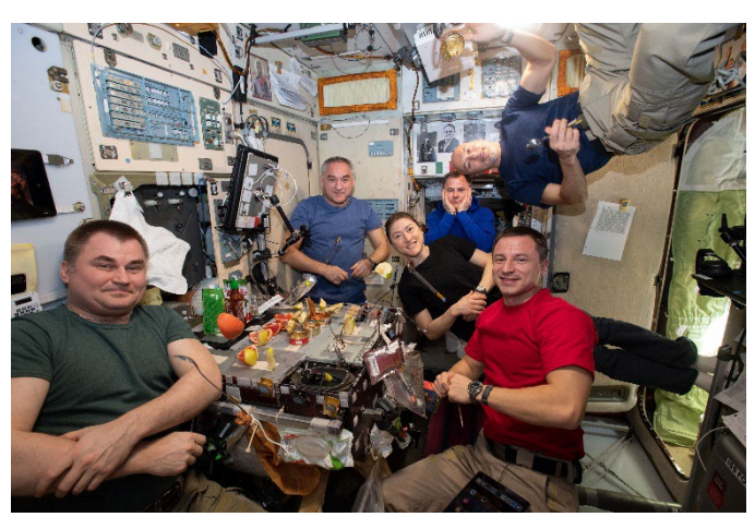
Members of Expedition 60 crew gather together for dinner inside the galley of the Zvezda service module.