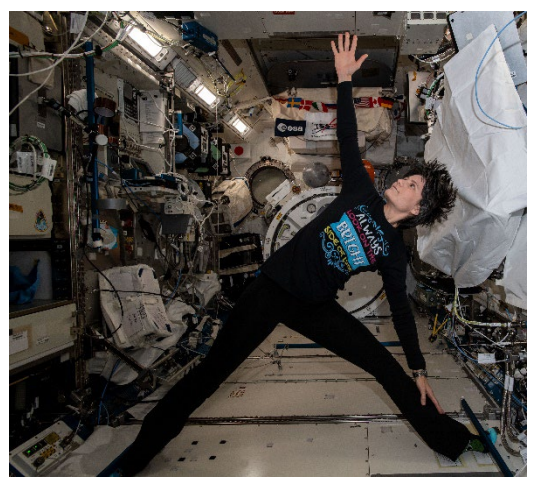
ESA astronaut Samantha Cristoforetti exercises and practices yoga maneuvers on the ISS.

[V1 3001] Selection and Recertification, [V2 7002] Food Acceptability, [V2 7008] Food Preparation, [V2 7012] Dining Accommodations, [V2 7038] Physiological Countermeasures Capability From: NASA-STD-3001 Volume 1 Rev C and NASA-STD-3001 Volume 2 Rev D