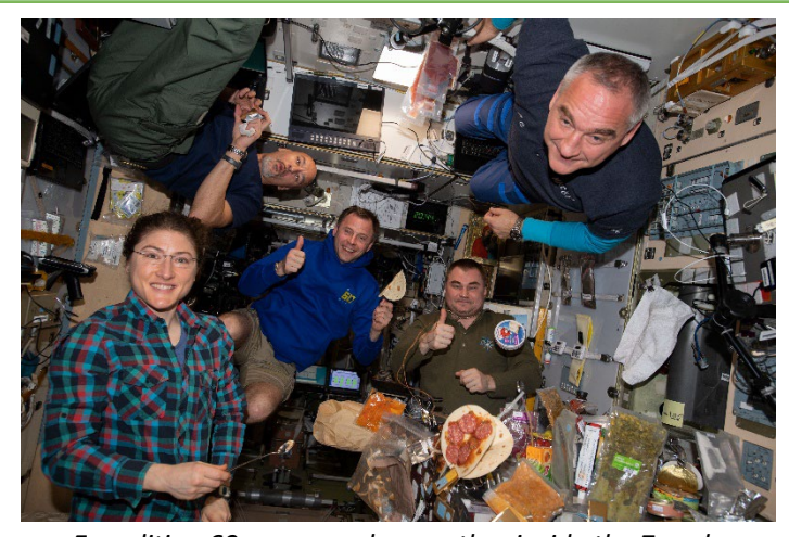
Expedition 60 crewmembers gather inside the Zvezda service module's galley for dinner on the ISS.