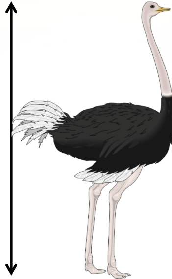
Ostrich for scale