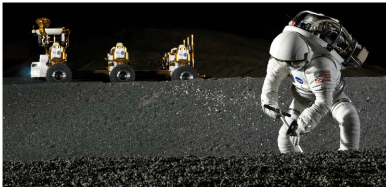
Figure 3: A spacesuit engineer simulates lunar work in a crater of NASA Johnson Space Center's Lunar Yard

On the TI-Nspire™ handheld, open the document, Metabolic_Rates , read through the problem set-up, and complete the instructions and questions embedded within the document.