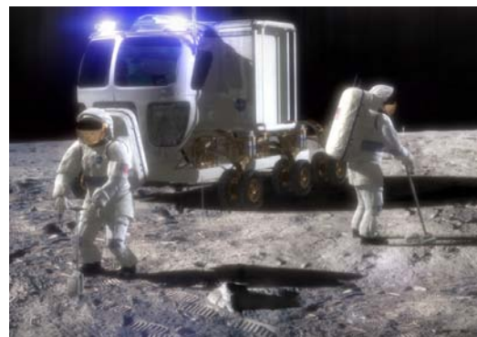
Figure 2: An artist depiction of astronauts exploring the lunar surface