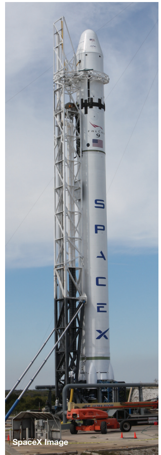
An image of the SpaceX Falcon 9 rocket on Pad 40 at Cape Canaveral, Fla.

At Florida's Cape Canaveral, within sight of the launch locations of every NASA human spaceflight mission to date, SpaceX will launch its Falcon 9 and Dragon spacecraft. Founded in 2002, SpaceX has designed these systems from the ground up using the best of modern technology. The Falcon 9, which will launch the Dragon to low-Earth orbit, uses SpaceX-designed Merlin LOX/RP-1 engines, with nine in the first stage and one in the second stage. The Dragon spacecraft is designed to carry cargo to ISS and return cargo to Earth. In December 2010, during the first COTS flight, SpaceX became the first private company to successfully return a spacecraft from Earth orbit.