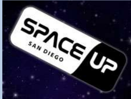
NASA sponsored the first ever SpaceUp barcamp in San Diego as a result of an idea and comments from the public

open.nasa.ideascale.com/a/dtd/19269-7044