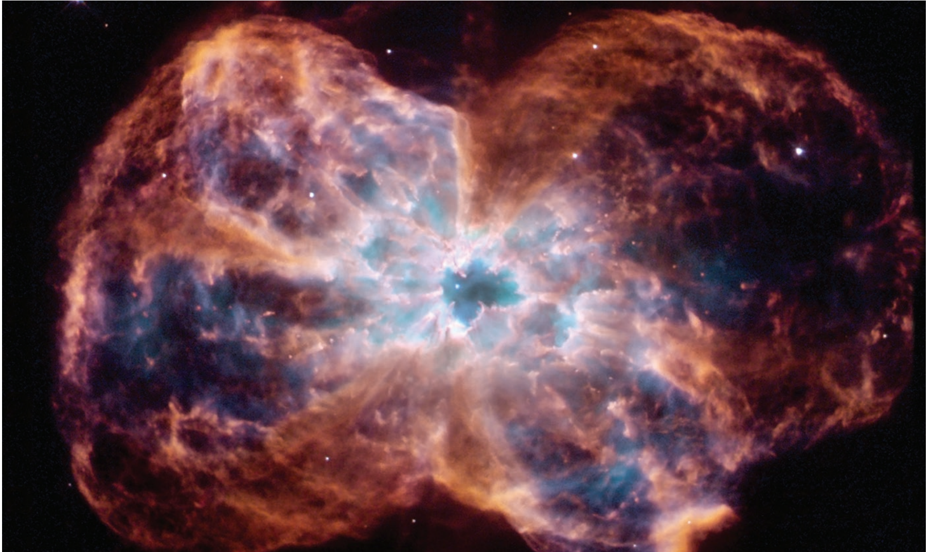
Planetary Nebula NGC 2440