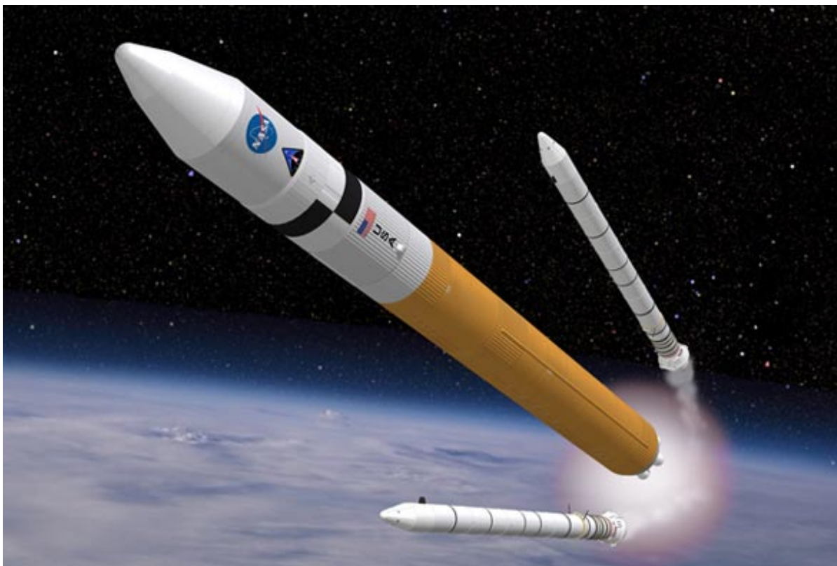
Concept image of Ares V in Earth orbit.

The Ares V effort includes multiple hardware and propulsion element teams at NASA centers and contractor organizations around the nation, and is led by the Ares Projects Office at NASA's Marshall Space Flight Center in Huntsville, Ala. These teams rely on nearly a half century of NASA spaceflight experience and aerospace technology advances. Together, they are developing new vehicle hardware and flight systems and maturing technologies evolved from powerful, proven Saturn rocket and space shuttle propulsion elements and knowledge.