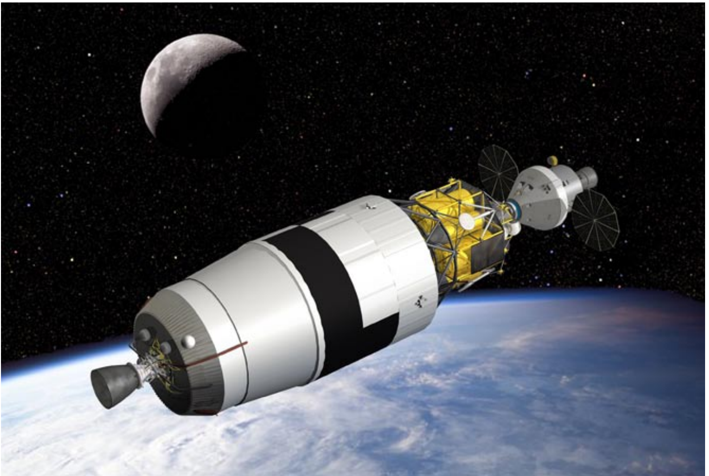
Concept image of the Ares V Earth departure stage in orbit, shown with the Orion capsule docked with the Altair lander

National Aeronautics and Space Administration