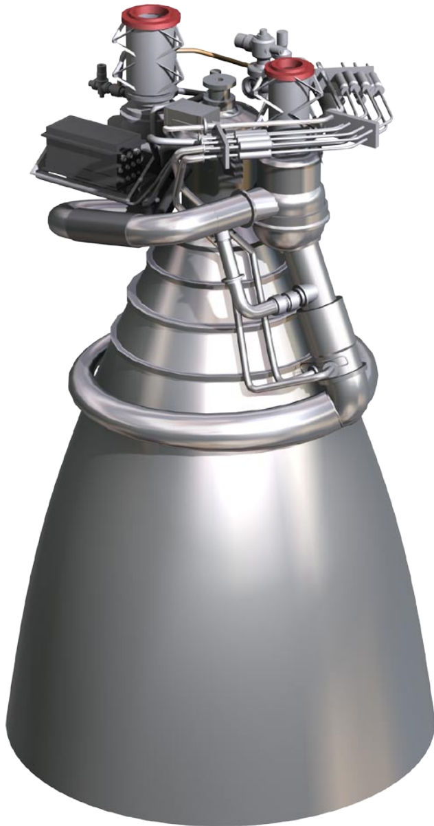
Concept image of the J-2X engine.

Atop the central booster element is an interstage cylinder, which includes booster separation motors. It connects the core stage to the Ares V Earth departure stage, which is propelled by a J-2X main engine. The J-2X, also powered by liquid oxygen and liquid hydrogen, is an evolved variation of two historic predecessors: the powerful J-2 upper-stage engine