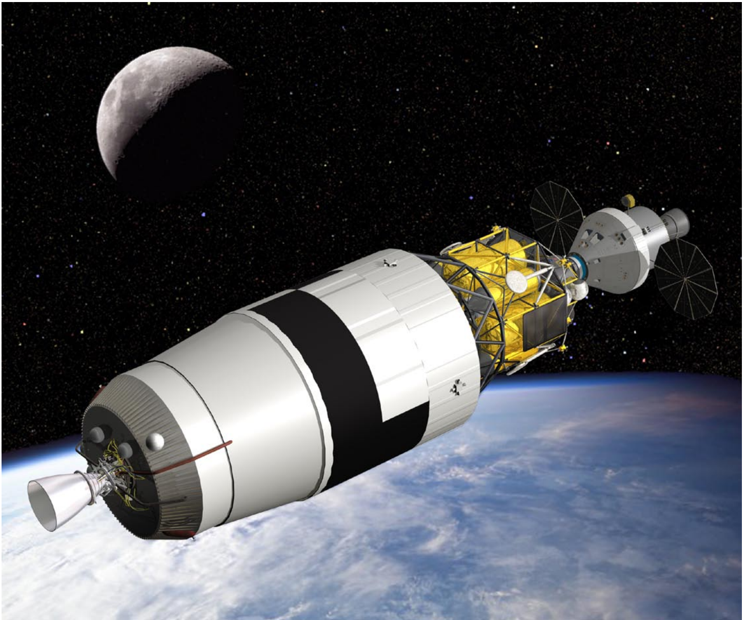
Concept image of the Ares V Earth departure stage in orbit, shown with the Orion capsule docked with the Altair lander

National Aeronautics and Space Administration