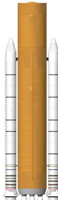
Core Stage LO x /LH 2 6 RS-68B Engines Al-Li Tanks Composite Structures