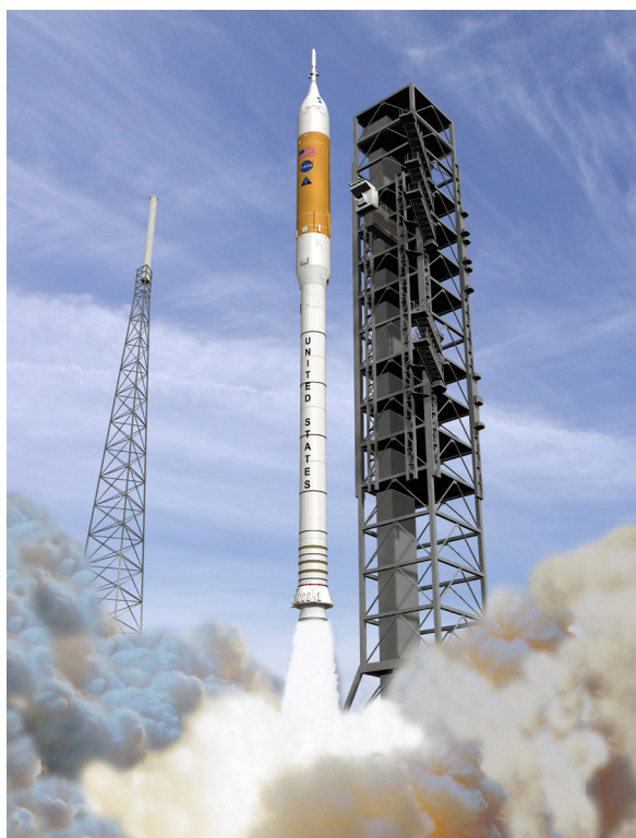
Concept image of launch of Ares I.

Ares I has two missions: lofting up to six astronauts (or cargo) to the International Space Station—approximately 52,000 pounds—or