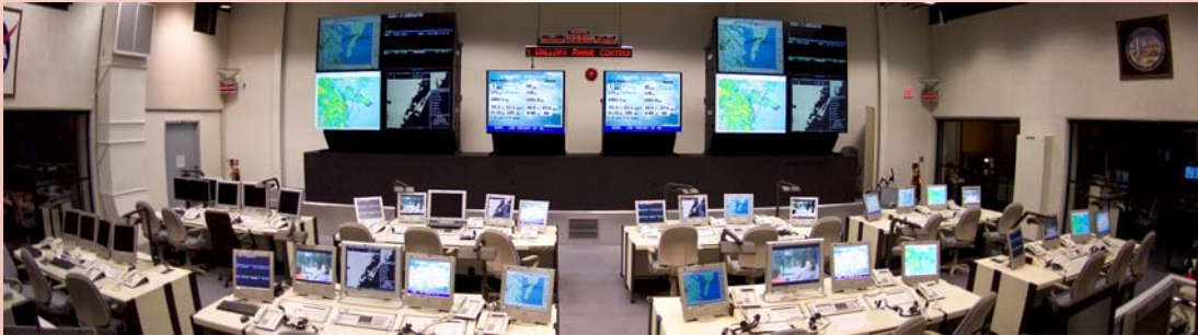
Range Control Center

The Control Center is the heart of launch operations. The NASA Test Director, Project Manager, and Range Safety Officer, as well as the rest of the joint operations team, use a full suite of data and display systems to monitor and control all launch activities.