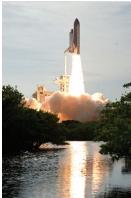
On the sixth attempt, Endeavour launches July 15, 2009, on the STS-127 mission.

Mission insignia for missions STS-129 to STS-134 have not yet been released . They will be added as they become available.