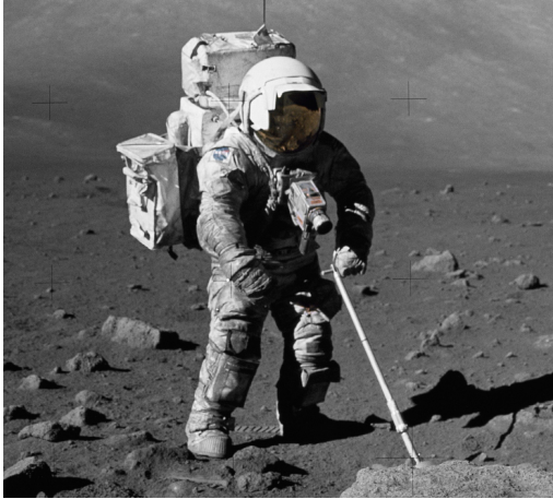
Figure 1. Substantial amounts of lunar dust were clearly adhering to Jack Schmitt’s spacesuit during Apollo 17.

Lunar dust resides in near-vacuum conditions, so the grain surfaces are covered in “unsatisfied” chemical bonds, thus making them very reactive. In an atmosphere, this “surface activity” would be pacified by reactions with the constituent gases (e.g. H 2 O or O 2 on Earth). In response to this potential hazard, NASA has formed the Lunar Airborne Dust Toxicity Advisory Group (LADTAG) to devise a strategy to evaluate this risk. Note that the Apollo astronauts were on the Moon for a relatively brief period of time, so it is not possible to fully assess the toxic effects of lunar dust. On Earth, such an assessment typically requires either chronic or intense exposures.