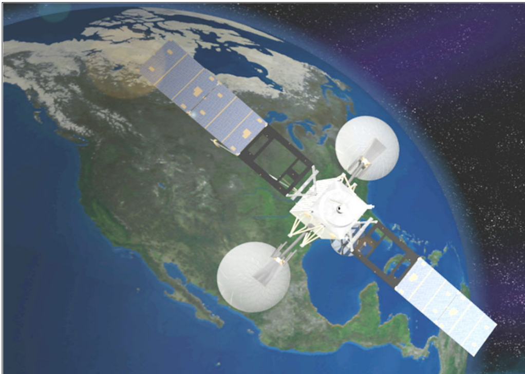
Artist concept of TDRS-H spacecraft on orbit.