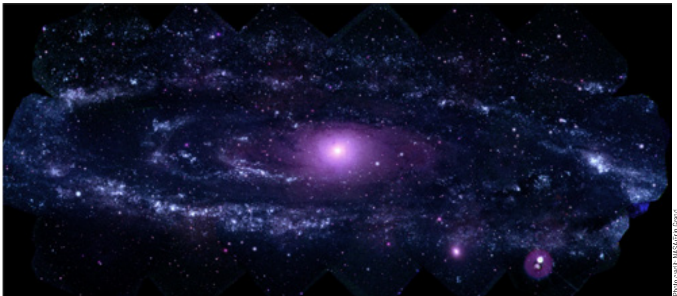
Caption: This mosaic of M31 merges 330 individual images taken by the Ultraviolet/Optical Telescope aboard NASA's Swift spacecraft. It is the highest-resolution image of the galaxy ever recorded in the ultraviolet.

Between May 25 and July 26, 2008, Swift 's Ultraviolet/Optical Telescope (UVOT) acquired 330 images of M31 at wavelengths of 192.8, 224.6, and 260 nanometers. The images represent a total exposure time of 24 hours. The task of assembling the resulting 85 gigabytes of images fell to Erin Grand, an undergraduate student at the University of Maryland at College Park who worked with Immler as an intern this summer. "After ten weeks of processing that immense amount of data, I'm extremely proud of this new view of M31," she said.