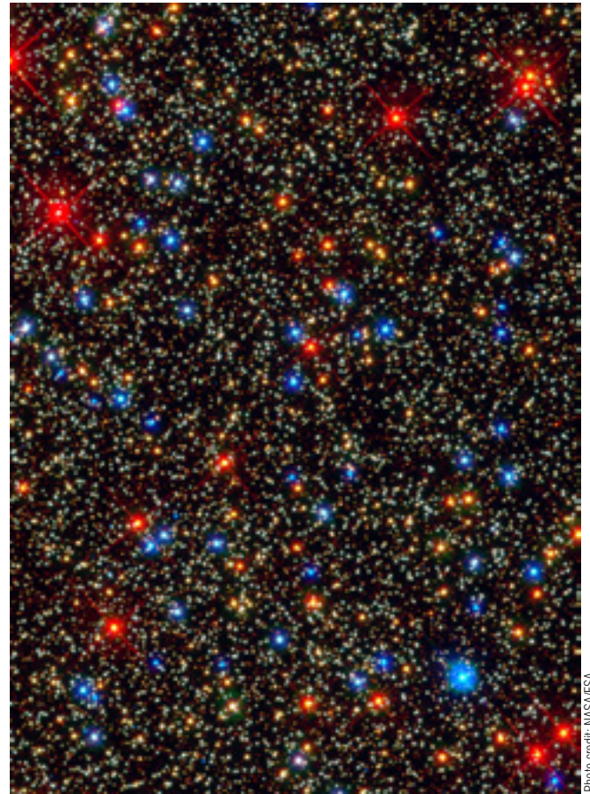
Caption: The Hubble Space Telescope snapped this panoramic view of a colorful assortment of 100,000 stars residing in a small region inside the massive globular cluster Omega Centauri, which boasts nearly 10 million stars. Globular clusters, ancient swarms of stars united by gravity, are the homesteaders of our Milky Way galaxy. The stars in Omega Centauri are between 10 billion and 12 billion years old.

The new instruments are more sensitive to light and will improve Hubble's observing efficiency significantly. It is able to complete observations in a