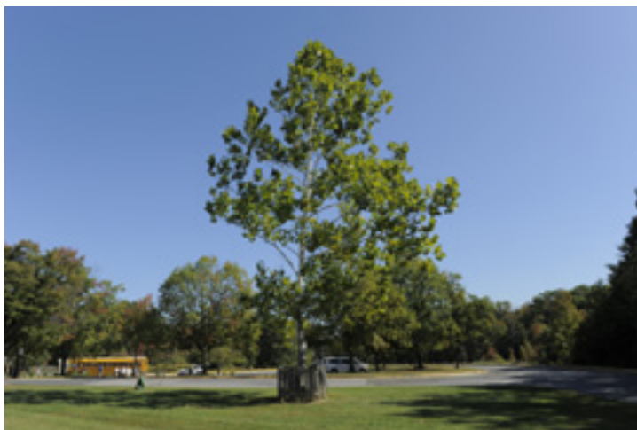
Caption: The same year the Goddard Visitor Center was constructed, a “moon tree” was planted in front of the new structure. Moon trees were grown from seeds flown aboard the Apollo 14 spacecraft. Dozens of moon trees continue to thrive in locations across the United States (from the September 1977 issue of “Goddard News”).