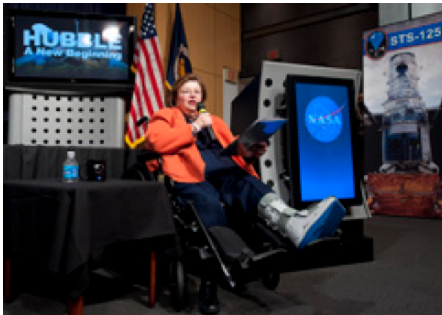
Caption: U.S. Senator Barbara A. Mikulski delivers remarks during a press conference where NASA unveiled new images from the Hubble Space Telescope.

"I fought for the Hubble repair mission because Hubble is the people's telescope," said Mikulski, Chairwoman of the Commerce, Justice, and Science Appropriations Subcommittee that funds NASA. "I also fought for Hubble because it constantly rewrites the science textbooks. It has more discoveries than any other science mission. Hubble is our greatest example of our astronauts working together with scientists to show American leadership and ingenuity. I want to salute Team Hubble —everyone who worked on Hubble from the Goddard Space Flight Center and Space Telescope Science Institute scientists in Maryland, to the ground crew at the Kennedy Space Center, to the Johnson Space Center where the astronauts train, and to the astronauts who were heroes in space."