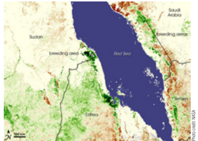
Caption: Swarms are not visible from space, but vegetation that they depend upon is readily detectable. In green, this NDVI-based map shows areas with especially lush vegetation, which serve as fertile locust breeding grounds.

“If DLIS warns locust control teams of a risk and then it doesn't materialize, or if it misses places where vegetation and swarms may be developing, then officials could be less apt to mobilize the next time,” said Pietro Ceccato, an associate research scientist at Columbia University in New York, who has also worked with the FAO on its locust monitoring system.