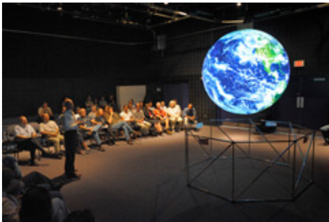
Caption: Goddard employees fill the Science On a Sphere theater at the Visitor Center to watch the premier of "Largest."

Called "Largest," the film is based on data from NASA's robotic missions to the outer solar system, including Voyager , Galileo , and Cassini , as well as Hubble Space Telescope observations. Watching the movie sends viewers on a journey stretching more than five times the Earth-Sun distance. Jupiter is a gas giant—more than 11 times wider than Earth—with a small core forever shrouded beneath a cloak of toxic, roiling clouds and oceans of liquid metallic hydrogen tens of thousands of miles deep.