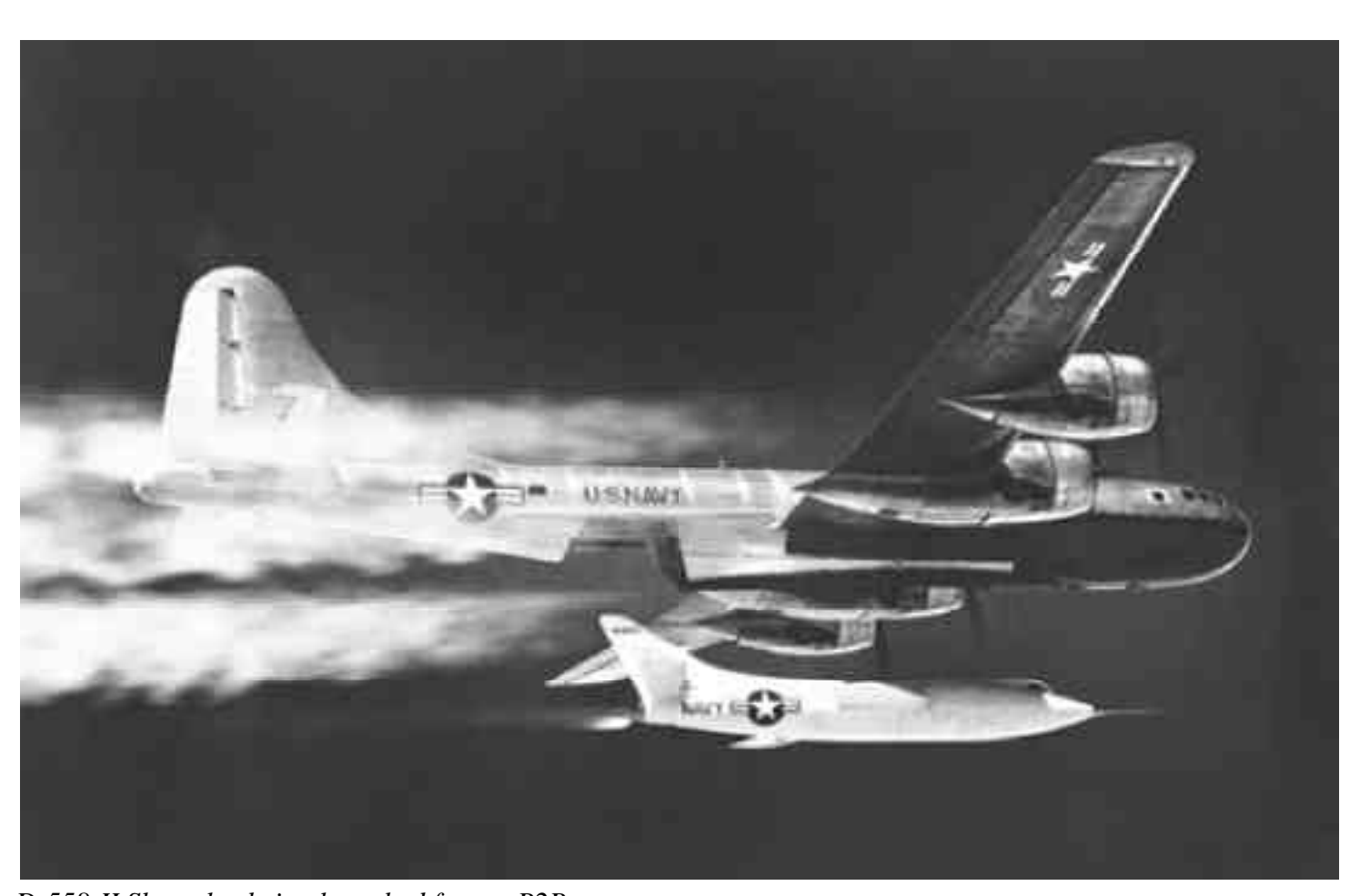
D-558-II Skyrocket being launched from a P2B.

The Douglas D-558-II "Skyrockets" were among the early transonic research airplanes like the X-1, X-4, X-5, and X-92A. Three of the single-seat, swept-wing aircraft flew from 1948 to 1956 in a joint program involving the National Advisory Committee for Aeronautics (NACA), with its flight research done at the NACA's Muroc Flight Test Unit in Calif., redesignated in 1949 the High-Speed Flight Research Station (HSFRS); the Navy-Marine Corps; and the Douglas Aircraft Co. The HSFRS is now known as the NASA Dryden Flight Research Center. The Skyrocket made aviation history when it became the first airplane to fly twice the speed of sound.