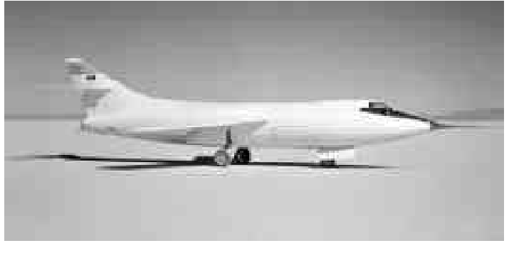
D-558-II Skyrocket on the Lakebed at Edwards AFB.

The three airplanes flew a total of 313 times--123 by the number one aircraft (Bureau No. 37973--NACA