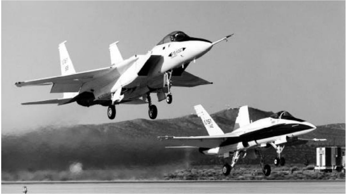
F-15 HIDEC landing with F/A-18 chase aircraft

Flight research carried out by NASA with a highly modified F-15 aircraft demonstrated and evaluated advanced integrated flight and propulsion control system technologies that will help make next-generation aircraft more maneuverable, more fuel efficient, and safer to fly.