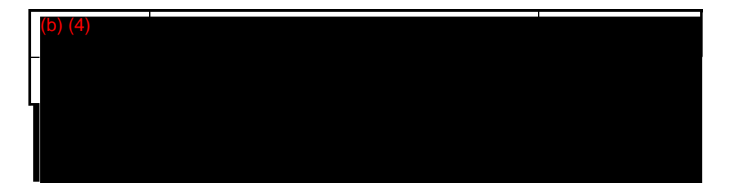
Table H.19.2 (b): Mission Milestone Review Payment Schedule