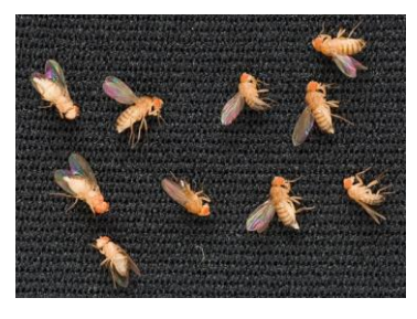
The common fruit fly (Drosophila melanogaster) under carbon dioxide anesthesia