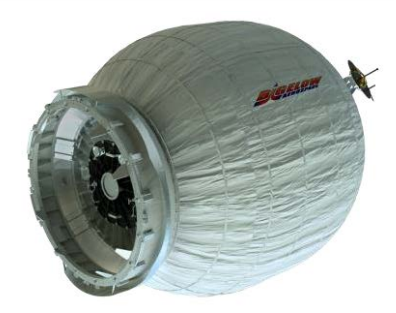
The Bigelow Expandable Activity Module (BEAM) is an experimental expandable capsule that attaches to the space station.

CASIS Protein Crystal Growth 4 has applications in medicine, specifically drug design and development. It has been established that growing protein crystals in microgravity can avoid some of the obstacles inherent to protein crystallization on Earth, such as sedimentation. One investigation will study the effect of microgravity on the co-crystallization of a membrane protein with a medically relevant compound in microgravity in order to determine its three-dimensional structure. This will enable scientists to chemically target and inhibit, with "designer" compounds, an important human biological pathway that has been shown to responsible for several types of cancer.