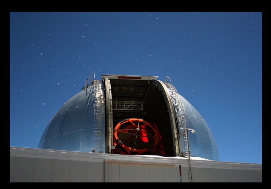
Asteroid Identification Segment:

Ground and space based NEA target detection, characterization and selection