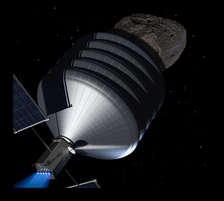
Asteroid Redirection Segment:

Solar electric propulsion (SEP) based robotic asteroid redirect to trans-lunar space