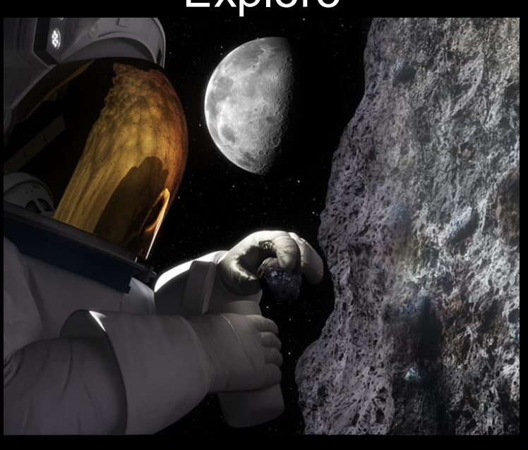
Asteroid Crewed Exploration Segment:

Orion and SLS based crewed rendezvous and sampling mission to the relocated asteroid