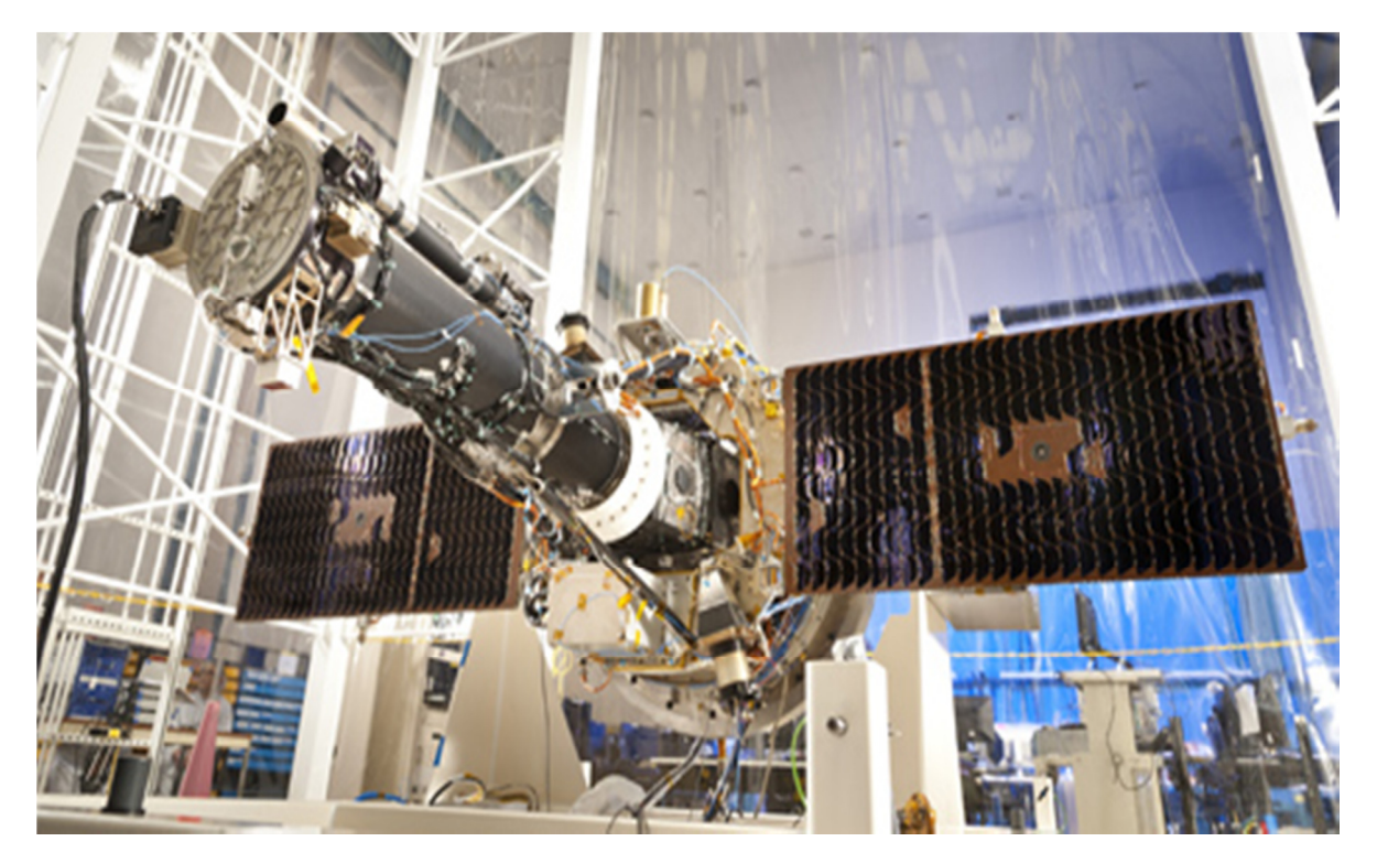
Image Caption: NASA's Interface Region Imaging Spectrograph with solar panels in flight position during pre-flight checkouts in the clean room at Lockheed Martin Advanced Technology Center in Palo Alto, Calif.

Maximum Downlink Rate: The science X-band data rate is 15 Mbps, delivered over 15 downlink passes, for a total rate of 60 gigabits/day.