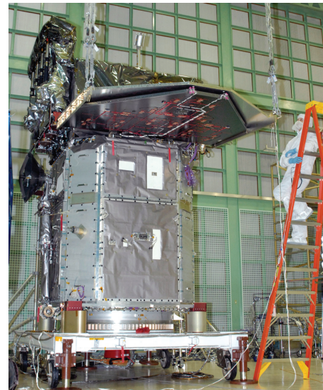
SDO being assembled in the clean room at Goddard

The Extreme Ultraviolet Variability Experiment (EVE) will measure the sun's ultraviolet brightness. The sun's extreme ultraviolet output constantly changes. Slow variations in ultraviolet flux affect Earth's atmosphere and climate. Rapid changes in ultraviolet radiation can cause outages in radio communications and affect satellites orbiting Earth. EVE will take measurements of the sun's brightness as often as every ten seconds, providing space weather forecasters with warnings of communications and navigation outages.