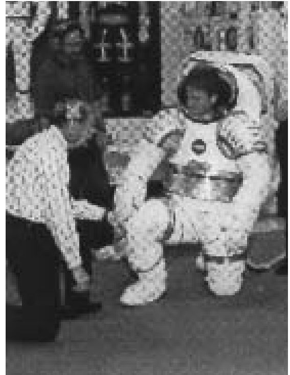
Spacesuit technicians test the mobility of a proposed hybrid suit design.

Another improvement in suit design will permit servicing and resizing suits in orbit. This improvement has already been tested on the STS-82 mission to service the Hubble Space Telescope. The original design of the Space Shuttle EMU required the removal or the addition of sizing inserts to lengthen or shorten legs and arms. This