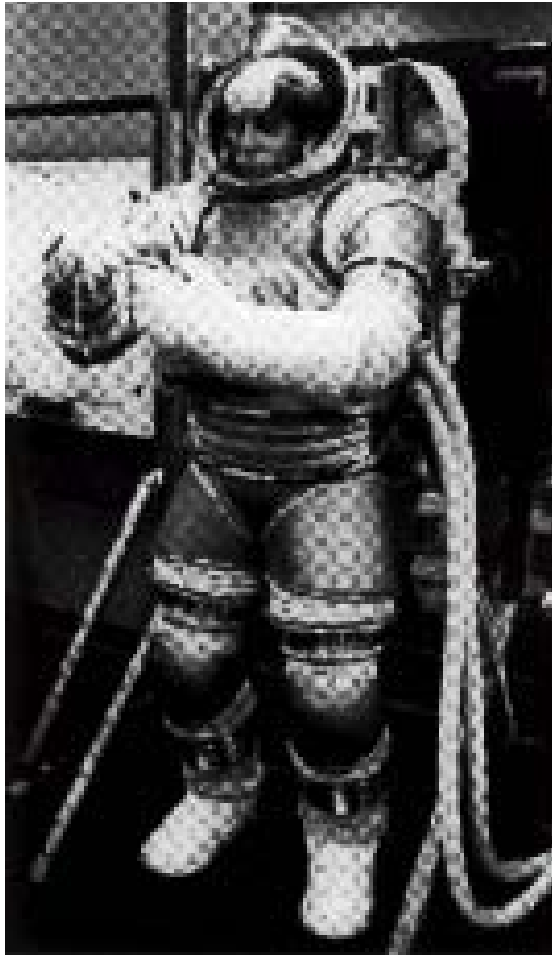
A prototype of a next-generation spacesuit is tested.

research has explored incorporating robotic aids into the glove such as motor and cable systems to provide grasping force at higher pressures. So far, such systems have not been successful because of the extra bulk added to the hands and arms of the suit and because of the "what if" problem of a system failing while the hand is clamped onto an object. That could make it very difficult to release the object.