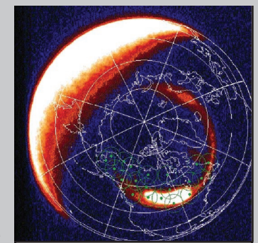
An image in far ultraviolet (FUV) light of the onset of an auroral substorm over North America (bottom right) and the reflected sunlight off of the upper atmosphere (top left). The FUV instrument on the IMAGE satellite took this image. Continents are drawn in white.

The aurora is aligned with Earth's magnetic field. The aurora has magnetic disturbances. Auroral light is produced near Earth at 100-130km, but it is related to distant Solar eruptions. Auroral displays are self-luminous and due to currents in space, which are carried by field-aligned, energetic electrons. These electrons are accelerated in the magnetosphere by the Solar Wind–Magnetosphere dynamo. Reconnection is important for plasma circulation. Auroral substorms have two distinct phases: expansion and recovery, the first of which starts suddenly (onset). Substorms are a magnetospheric phenomenon, which begin with a growth phase prior to onset. Onset is proposed to be caused by magnetic